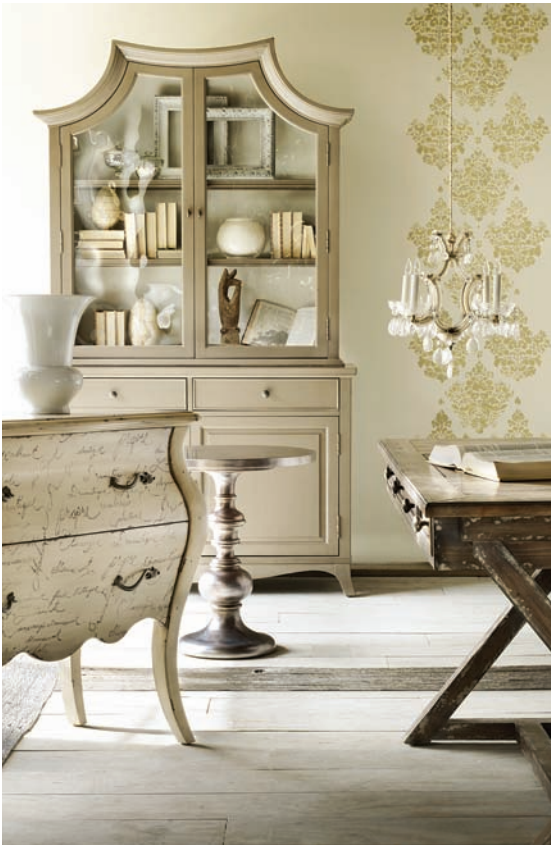
Melange, Hooker Furniture's newest collection, is French for a "mix," often of incongruous elements. Accents blend colors and materials in unexpected ways.

NO SINGLE DESIGN SCHEME WILL DOMINATE in 2011. Instead, periods and styles will mix in fresh and modern fashion.