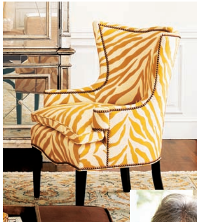
Sunflower Zebra Chair from Horchow.

ANIMAL PRINTS have exhibited surprising staying power. I think that's because their exotic, wild, and often whimsical