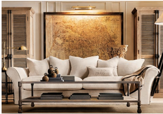
A page from Restoration Hardware's catalog mixes industrial chic accents with reclaimed woods and antiques.