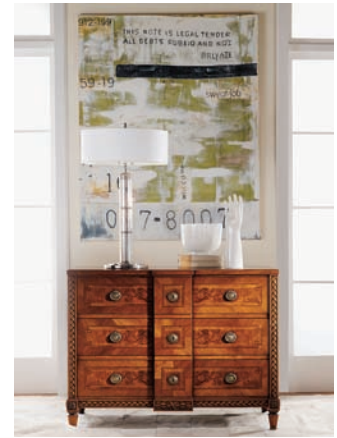
Modern History pairs contemporary accessories and a traditional chest for a sophisticated statement.